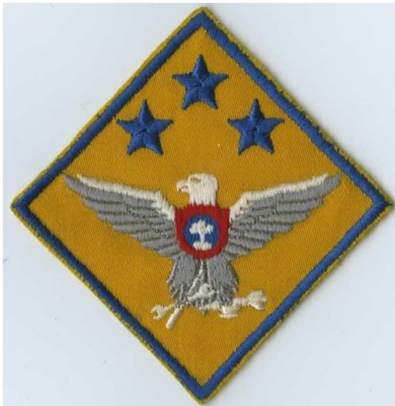
81 Organizational Maintenance Squadron emblem